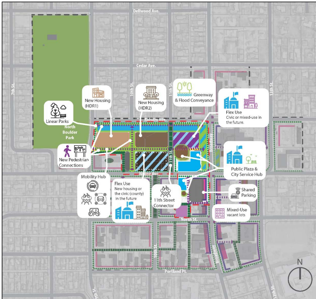
Conceptual Diagram of City Site Future Uses and Improvements, Area Plan page 12

Renovation of the Brenton building completed in 2018 demonstrated early successes on the campus by consolidating a fragmented department into one building and converted one of the city’s worst energy performing buildings into a now near net-zero energy consuming building. Renovation of the Pavilion building and improvements to the site will create a cohesive campus that has the potential to consolidate staff from at least four additional buildings. The City Council approved 2020 budget includes the first phase of the city campus and Pavilion design work. More information on the consolidation of city services can be found at the following council memo links: November 13, 2018 ; February 12, 2019 ; and May 16, 2019 .