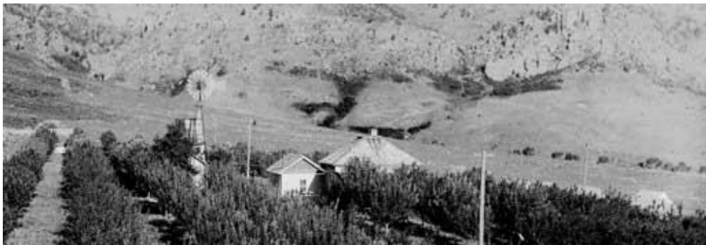
Photo: The Batchelder Ranch prior to 1898; the entrance to Gregory Canyon is behind the windmill.